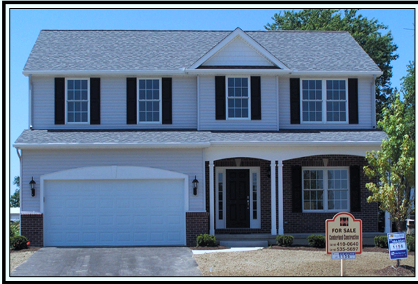
Photo may show some items that are optional & extra in cost. Call for pricing and details.

Four Bedrooms Two and a Half Baths Basement 2121 Square Feet ±